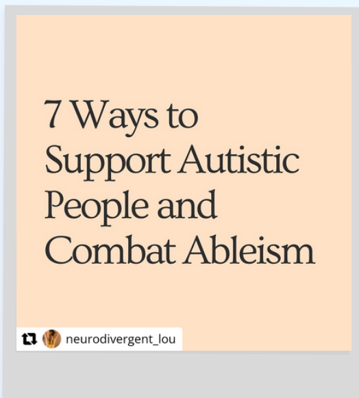
Practical ideas to support the Autistic community and also combat ableism.