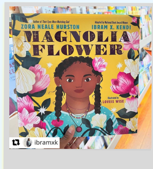
Ibram X. Kendi shares his new book which is adapted from a 1925 short story by Zora Neale.