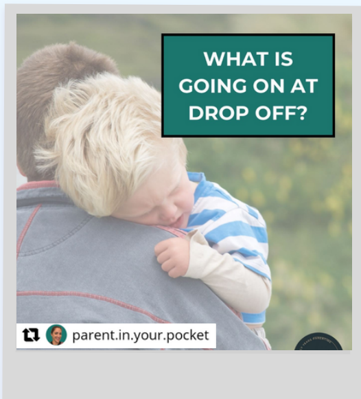
Rosie Joyce talks us through the emotional complexities that occur at drop off time.