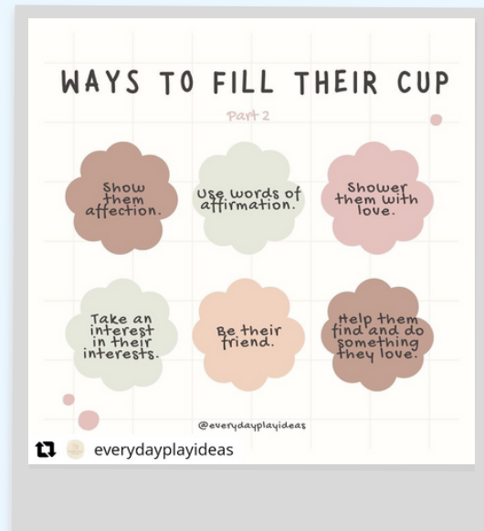
Emma gives us 6 straightforward ways to 'fill a child's cup'.