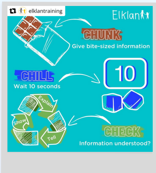
Elklan provide guidance on interactions with children, especially when giving instructions.