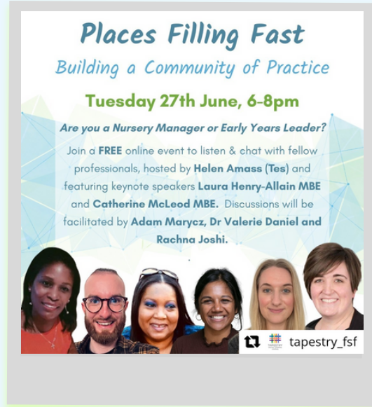
The FSF hosted a free online event on 27th June – look out for the video coming soon to YouTube.